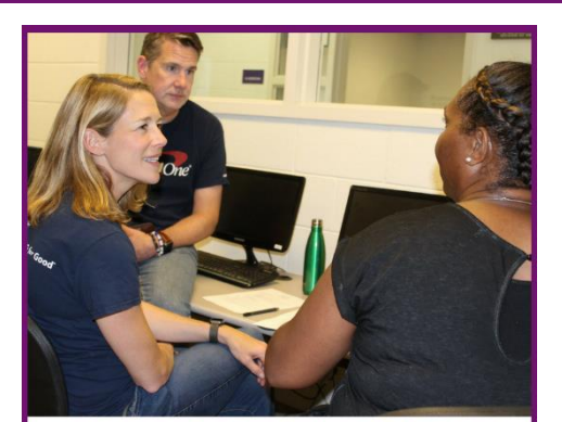
Capital One associates speak with a Peter Paul parent about her career interests and how to job search for positions that will match her skills and passions.

Peter Paul has been working hard to support the parents of the students we serve. The Promise Family Network (PFN) was created to strengthen the family and connect parents with needed resources and with one another. PFN offers free training such as parenting workshops, family field trips, and access to workforce development opportunities.